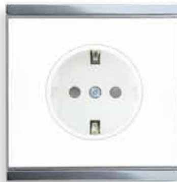
Corlo Power Outlet, chrome glossy