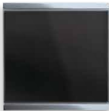
Corlo Push Button M1-T, chrome glossy