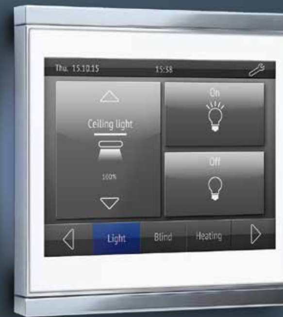
Corlo Touch KNX