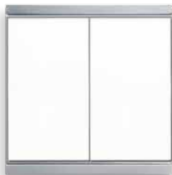
Corlo Push Button M2-T, chrome matt

All components of System Corlo are installed in standard sockets. Frames are available as 1-, 2- or 3-gang version. The Wireless push buttons Corlo P RF can be mounted without a socket directly on the wall with special frames Corlo Plane .