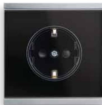
Corlo Power Outlet, chrome matt